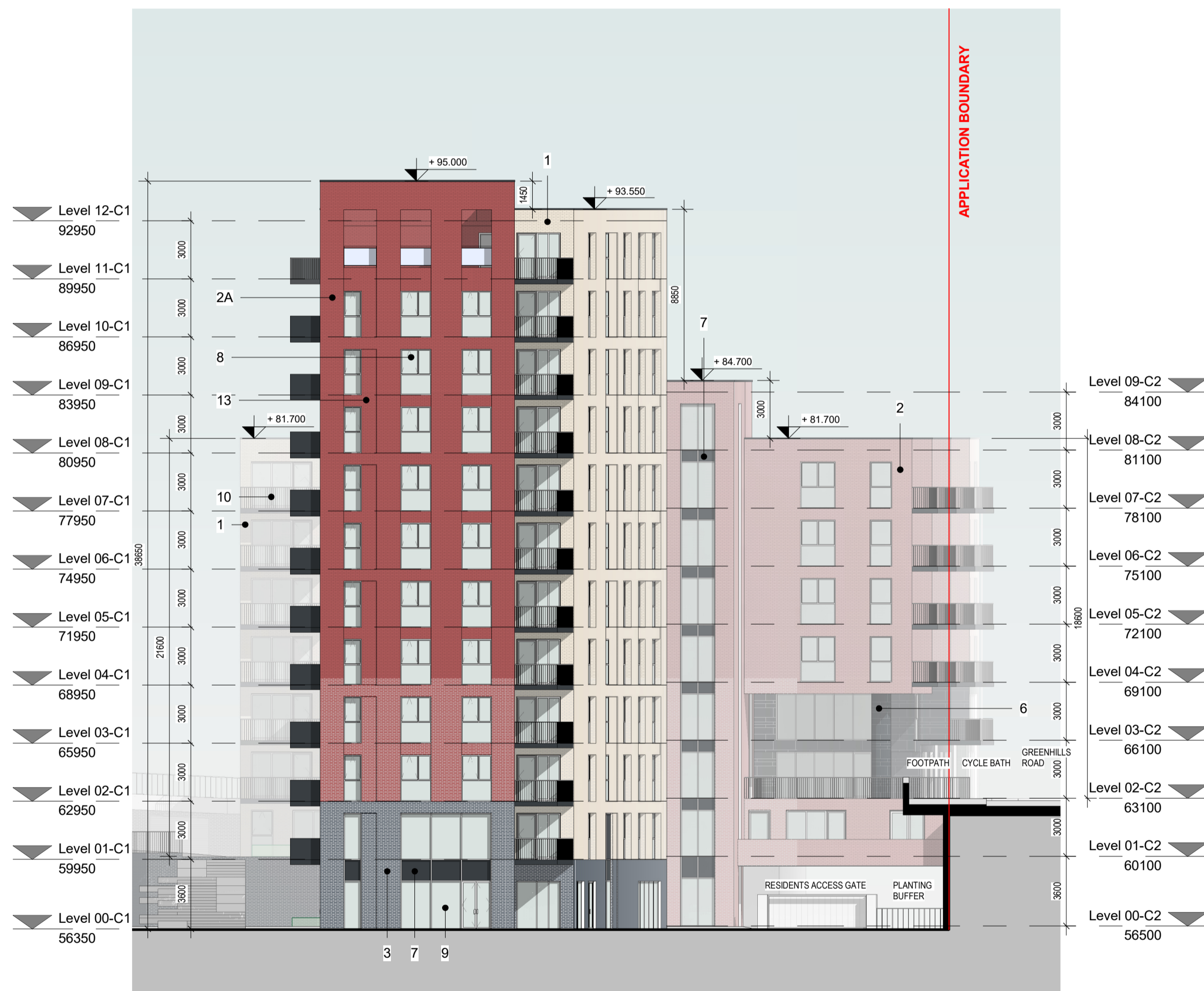
1 BLOCK C - PROPOSED EAST ELEVATION 1 : 200